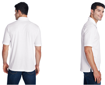
Featured Color: WHITE